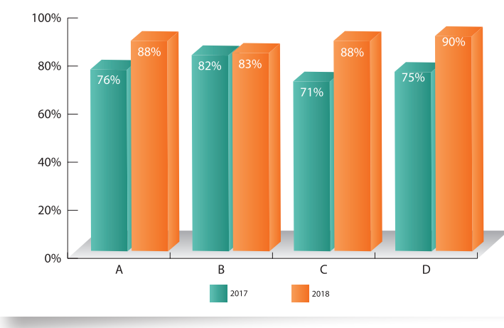
Figure 3. Caregiver satisfaction survey results